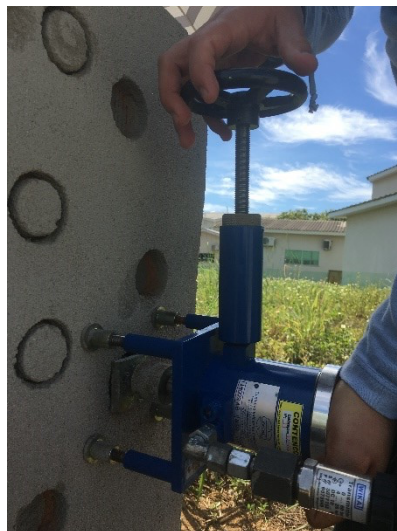
Figure 2. Execution of the tensile bond strength test

The execution of the tensile bond strength test followed the guidelines defined by NBR 13528: 2010 as shown in (Figure 2). The equipment was the Contenco brand hydraulic handheld adherometer that applies the traction force perpendicular to the coating surface.