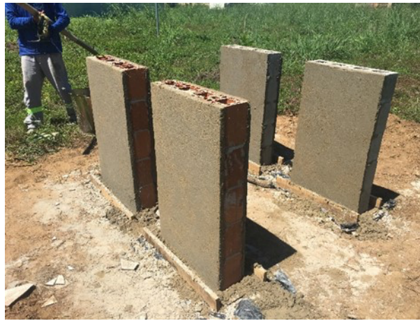
Figure 1. Rendering mortar on walls with ceramic and concrete block

The mortar was characterized in its fresh stage for specific gravity, entrained air content, and rheology by the squeeze flow method, following NBR 13278 and NBR 15839, respectively.